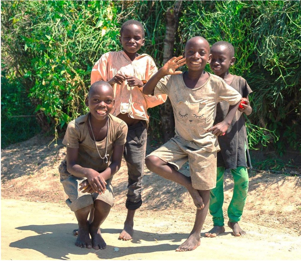
Shown here are a few beneficiaries of the new well.